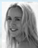
Edwina Griffin , health and high performance expert. www.edwinagriffin.com